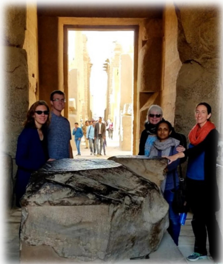
2018 began with a prayer journey through ancient temples in Egypt.