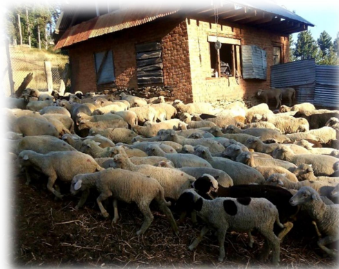
The sheep project is growing and the village is very hopeful for the future.