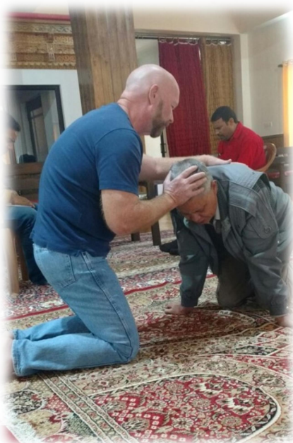
Praying for the Pastor of the Moravian Church in Leh – a church no longer divided